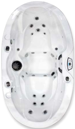
Rejuvenate with Cal Spas® Exclusive Fountain Of Youth™ Powered by MicroSilk®