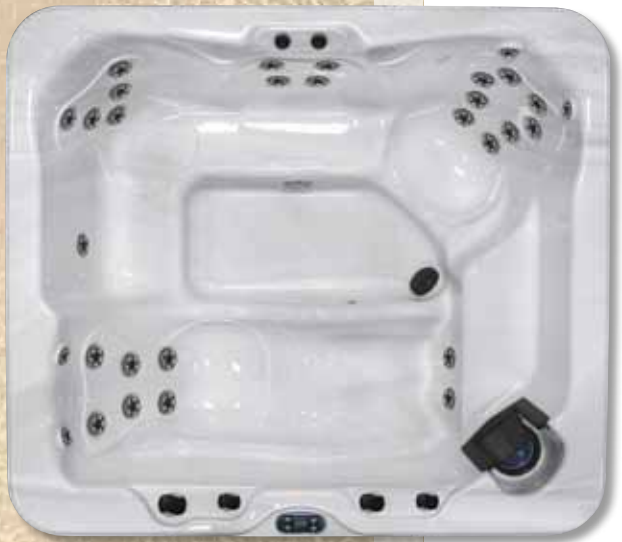
GII 630L • Seating: 6 • Dimensions: 84" x 74" x 36" • Water Capacity: 340 (1,287 L)