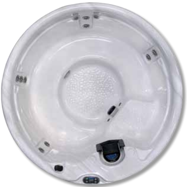
GII 511R • Seating: 6 • Dimensions: 78" x 36" • Water Capacity: 300 (1,136 L)