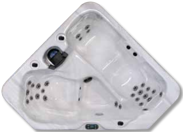
GII 628T • Seating: 3 • Dimensions: 72" x 72" x 35" • Water Capacity: 130 (492 L)