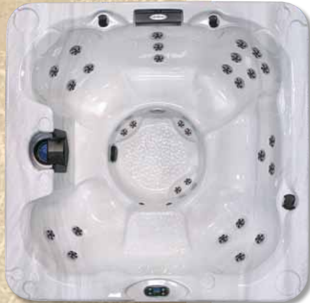
GII 730B • Seating: 6 • Dimensions: 84" x 84" x 36" • Water Capacity: 425 (1,609 L)