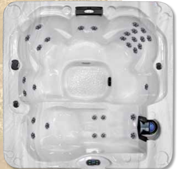
GII 730L • Seating: 6 • Dimensions: 84" x 84" x 36" • Water Capacity: 425 (1,609 L)