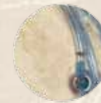
High Density Foam