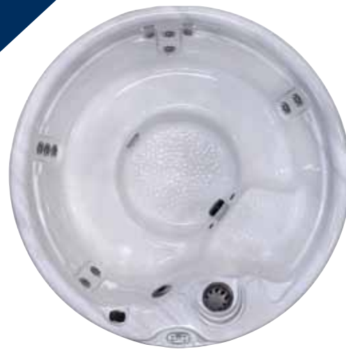
S-512R ROUND 78" DIA x 36"H