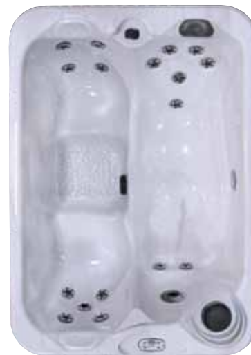
S-517L BALBOA 54"W x 78" L x 36"H