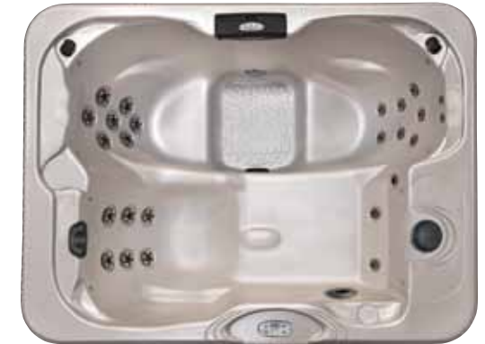
S-525L KONA 84"W x 64"L x 36"H