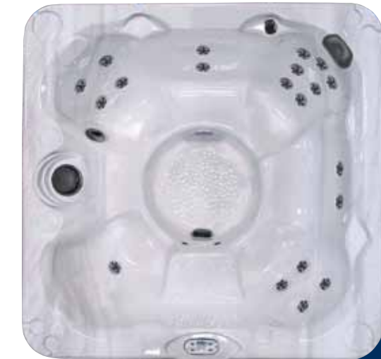
S-721B TROPICAL 84"W x 84"L x 36"H