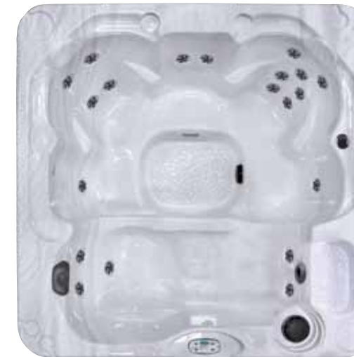
S-721L PACIFICA 84"W x 84"L x 36"H