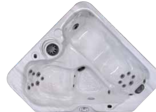
S-617T VISTA 72" x 72" 36"H