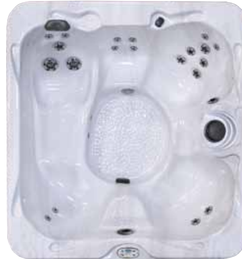
S-621L HAWAIIAN 76"W x 84" L x 36"H