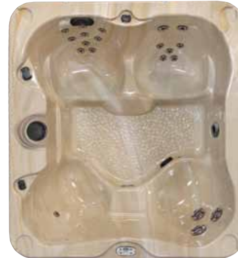
S-621B ARIZONA 78"W x 84" L x 36"H